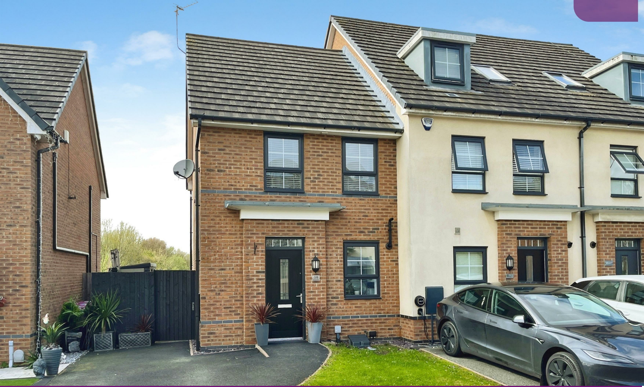
19 Deanland Drive, Liverpool, L24 1WA Offers over £190,000